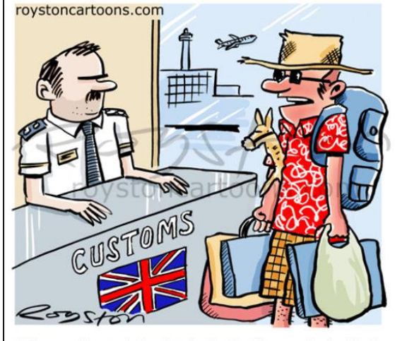
'I have nothing to declare but the fact that I'm completely skint."

"It took us nine hours to fly home from Jamaica to England. It took the Americans only 3 hours to get home"